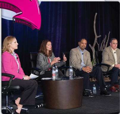
Panel Discussions, Group Discussions and Thought-Leaders

Tap into their expertise and share ideas in one of the many panel discussions or casually during the event.